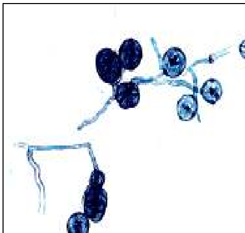
Figure 1. Ulocladium atrum , conidiophores and conidia.

White P, Wolf P, Thomas C, Reynolds C (2006) Phytoremediation of alkated aromatic hydrocarbons in crude oil contaminated soil. Water and Air Pollution 169:207-220